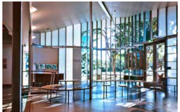
Caloundra Art Gallery, Queensland