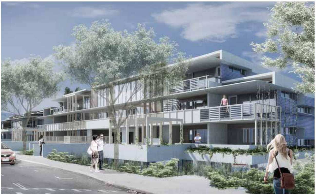
Bottlebrush Avenue Housing Development (53 Units), Noosa Heads, Sunshine Coast

“Variable in colour, texture, density, character, it is invariably the role of bark to define the line between inside and out; to negotiate the relationship between the internal and external environment; to contain, protect, house.”