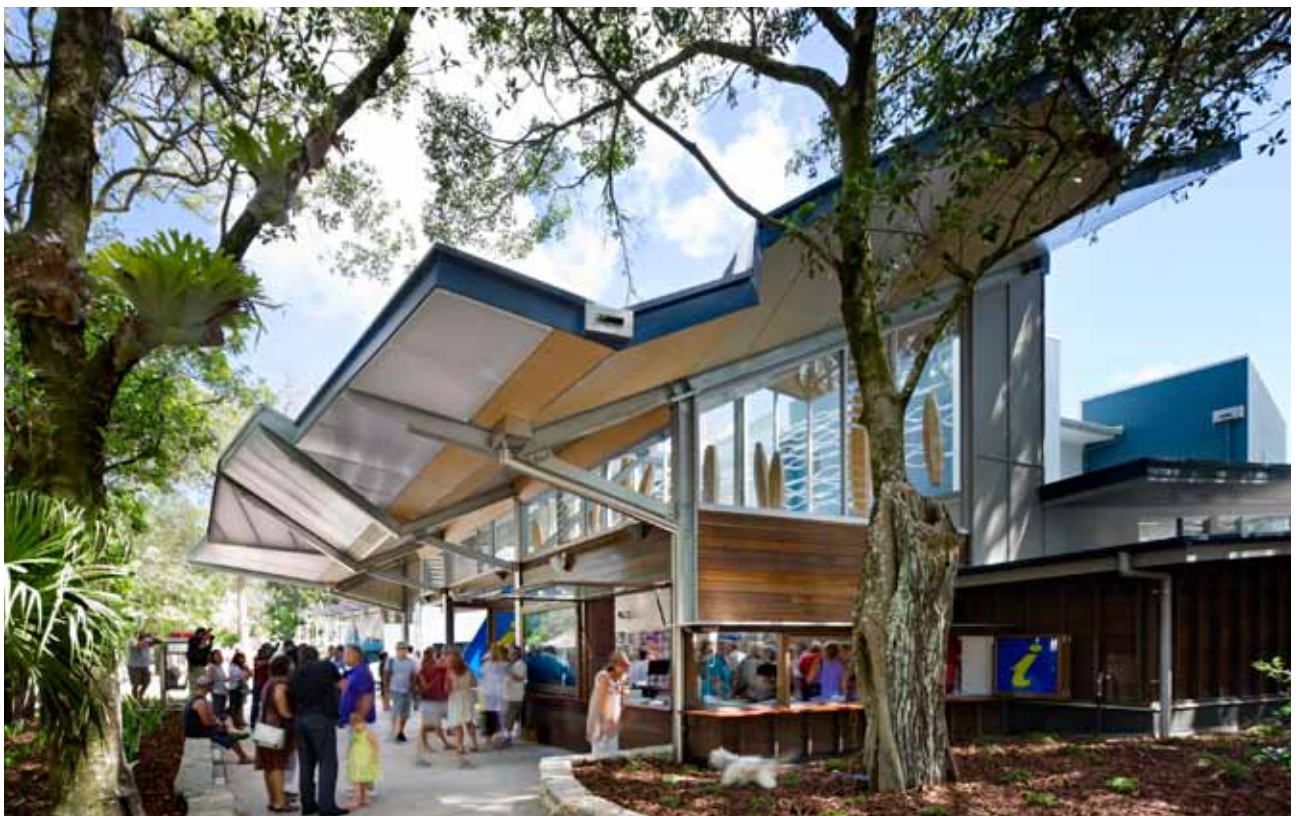
Noosa Visitor Information Center, Hastings Street, Sunshine Coast