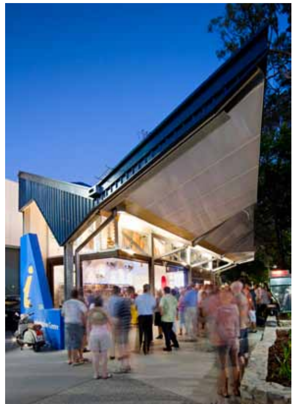
Award winning Noosa Visitor Information Centre, Hasting Street, Noosa Heads, Queensland