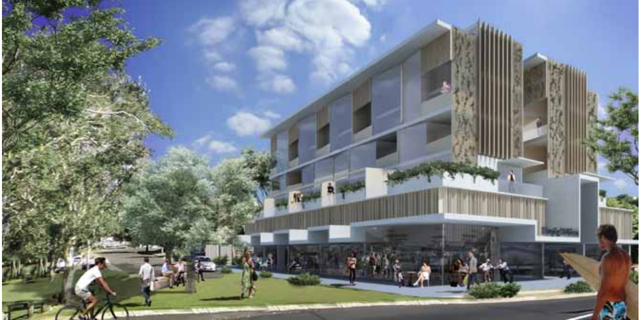
Brisbane Road Mixed Use Development, Mooloolaba, Sunshine Coast

“Bark has made a significant contribution to the strong reputation and regard for the architectural style and reputation of the Sunshine Coast region, recognised and celebrated on a national and international level”.