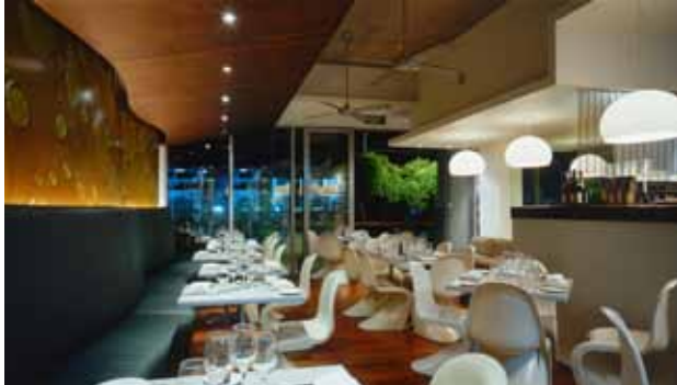
Ba Vigo Restaurant & Bar, Cotton Tree, Queensland

Bark projects have been recognised with over 20 design and industry awards and have been widely published in many national and international books, magazines, and websites.