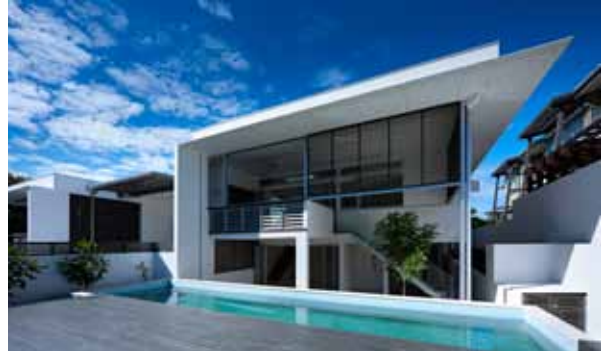
'Coast' Apartments, Sunshine Beach, Queensland