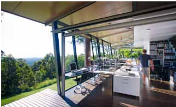
AIA 'Beatrice Hutton' State Award for Commercial Architecture, Bark Design Studio