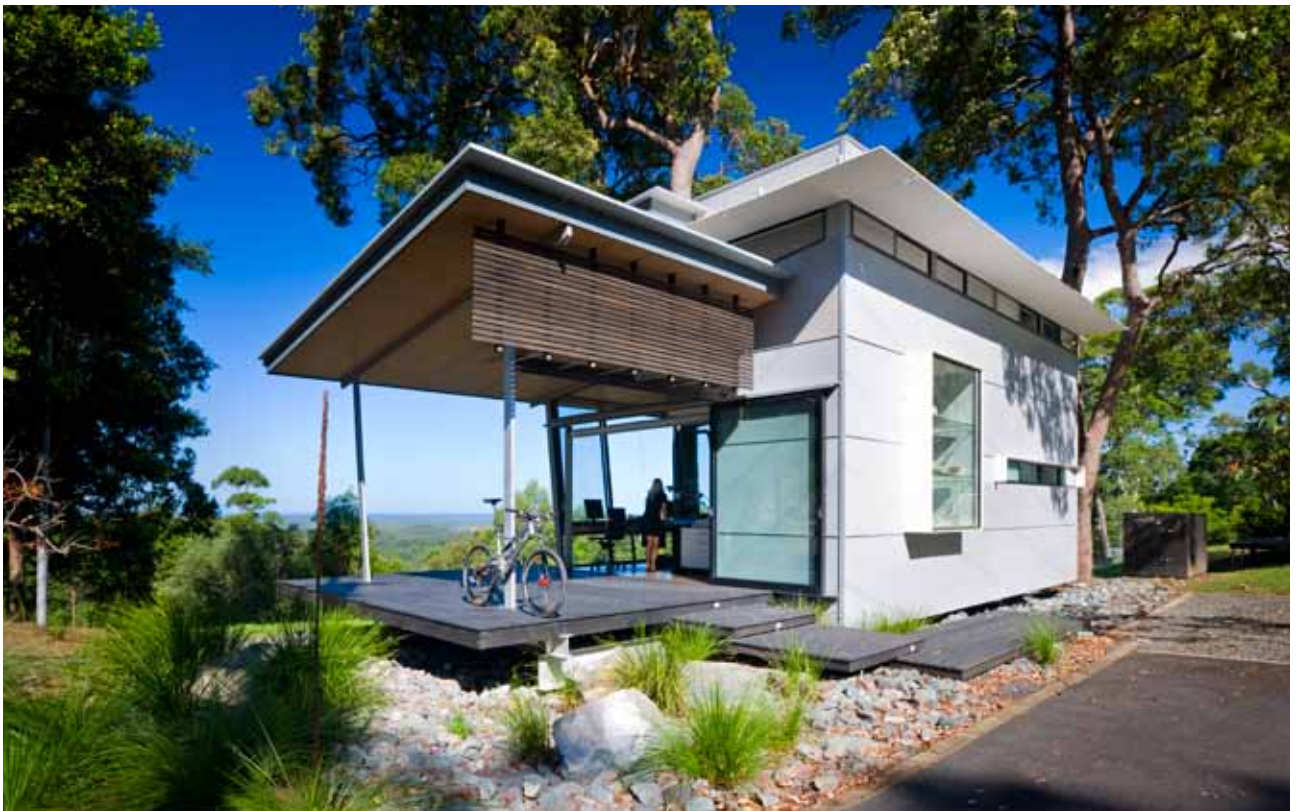
Bark Design Architects' Multi Award Winning Studio in the Noosa Hinterland

"Like bark, our architecture is an environmental living, growing and changing skin or structure, which offers protection, whilst affording our clients a sensitive and inextricable link to the landscape which they inhabit"