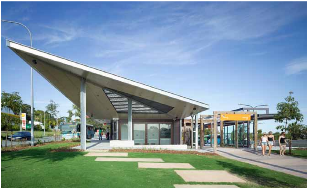
Multi award winning Noosa Junction Station, Sunshine Coast, Queensland