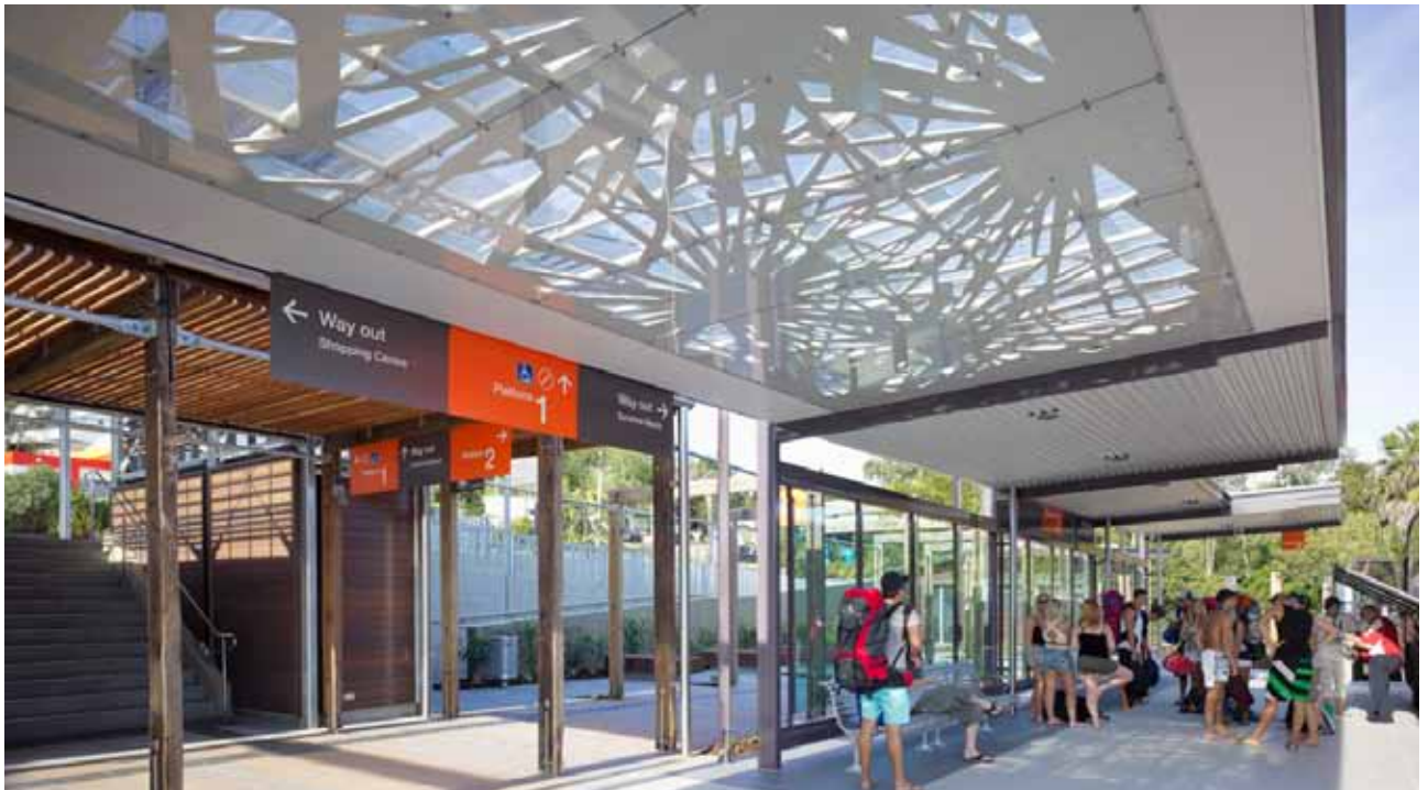
Multi award winning Noosa Junction Station, Sunshine Coast, Queensland