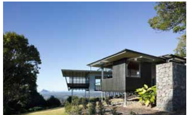
Maleny House, Queensland