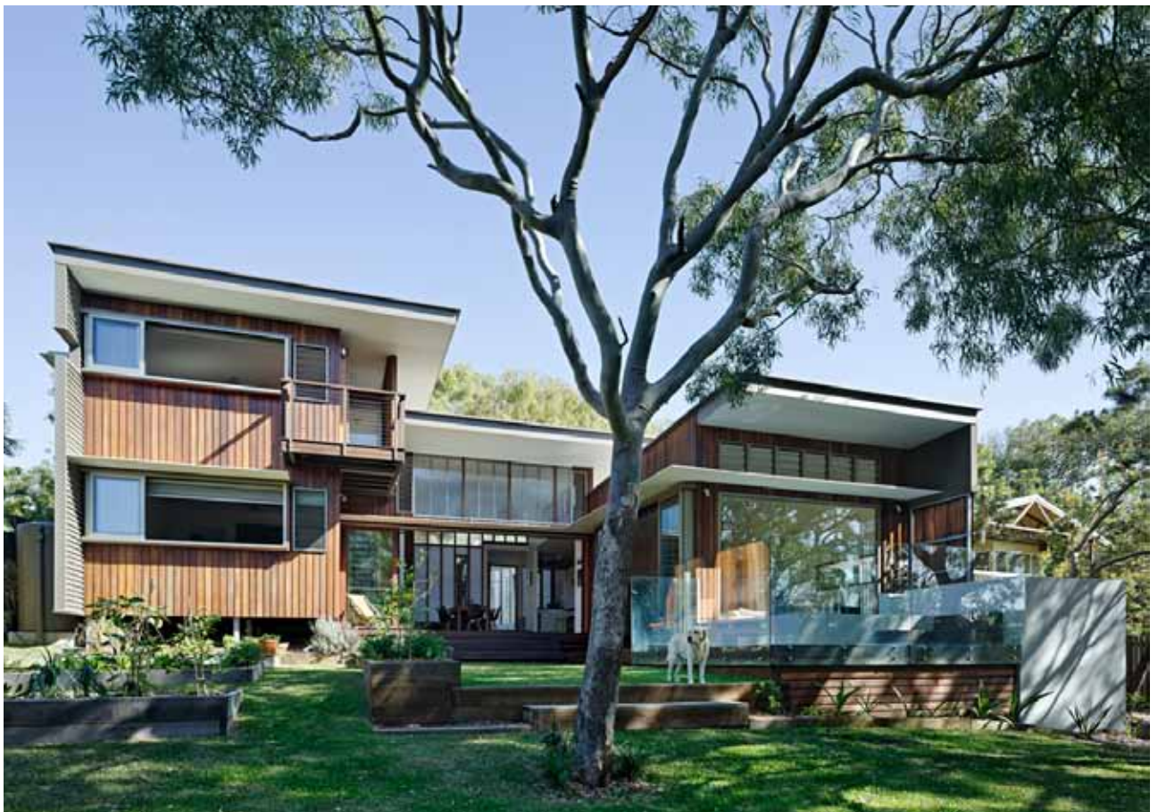
Spoonbill House, Peregian Beach, Sunshine Coast

“Bark has made a significant contribution to the strong reputation and regard for the architectural style and reputation of the Sunshine Coast region, recognised and celebrated on a national and international level”.