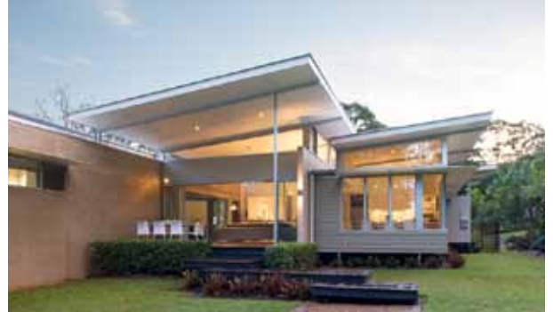
Noosa Hinterland House, Sunshine Coast, Queensland