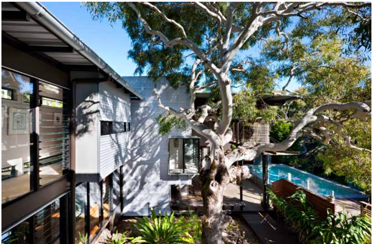
Multi award winning Marcus Beach House, Sunshine Coast, Queensland