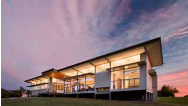
Award winning Hervey Bay House, Queensland

Bark projects have been recognised with over 20 design and industry awards and have been widely published in many national and international books, magazines, and websites.