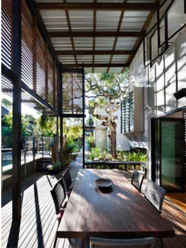
Marcus Beach House, Sunshine Coast, Queensland