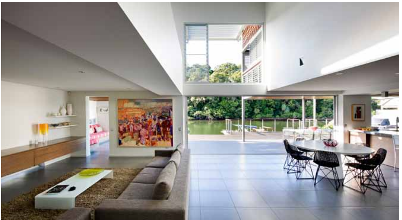
Noosa Sound House, Noosa Heads, Sunshine Coast

“Variable in colour, texture, density, character, it is invariably the role of bark to define the line between inside and out; to negotiate the relationship between the internal and external environment; to contain, protect, house.”