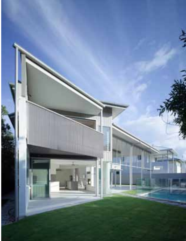
Beachside House, Coolum, Sunshine Coast