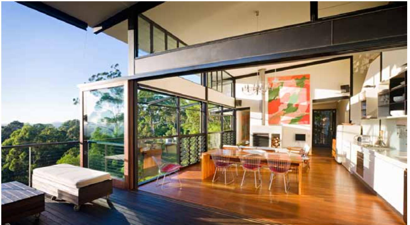
Tinbeerwah House, Noosa Hinterland, Sunshine Coast, Queensland

Bark Design Pty Ltd PO Box 1355 Noosa Heads Queensland 4567