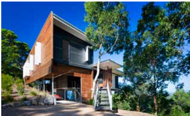
Tinbeerwah House, Noosa Hinterland, Sunshine Coast