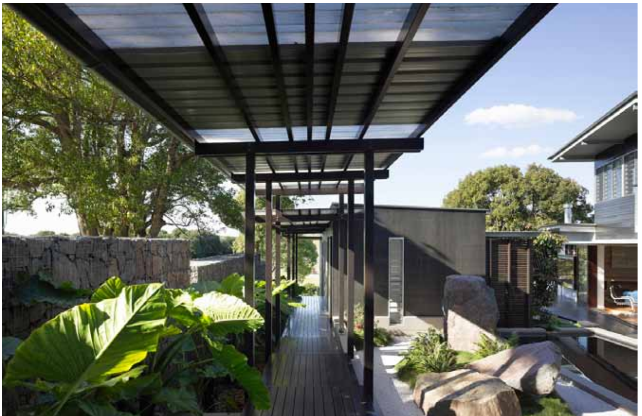
Maleny House Courtyard, Sunshine Coast Hinterland, Queensland

Like bark, our architecture is an environmental living, growing, and changing skin or structure which offers protection, whilst affording our clients a sensitive and inextricable link to the landscape which they inhabit.