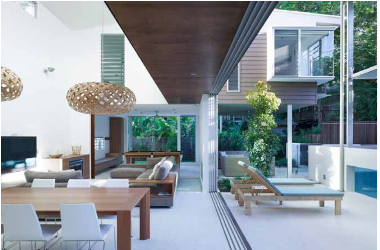
Award winning Sunshine Beach House, Sunshine Coast, Queensland